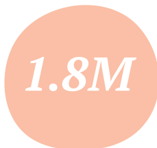
Women have access to Bloom