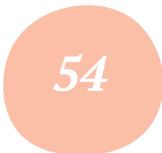
Clients are prioritizing women’s pelvic health

Since its launch, in March of 2022, Bloom was selected as the pelvic-health solution by 54 employers and health plans. This provides access to the innovative wellness benefit to 1.8 million women.