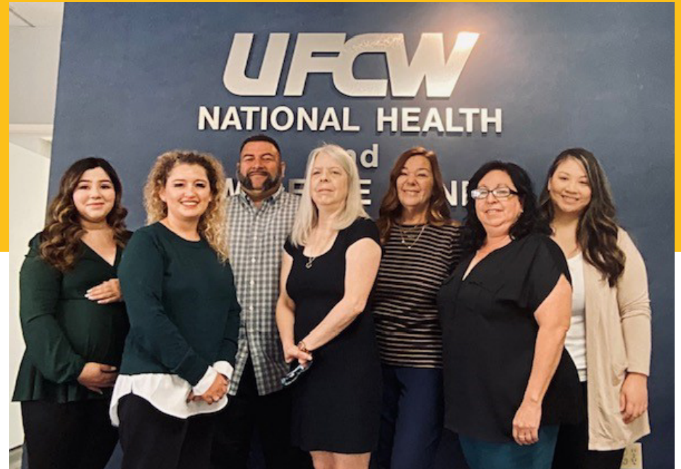
Stockton, CA team

For specific information, drop us a line at: