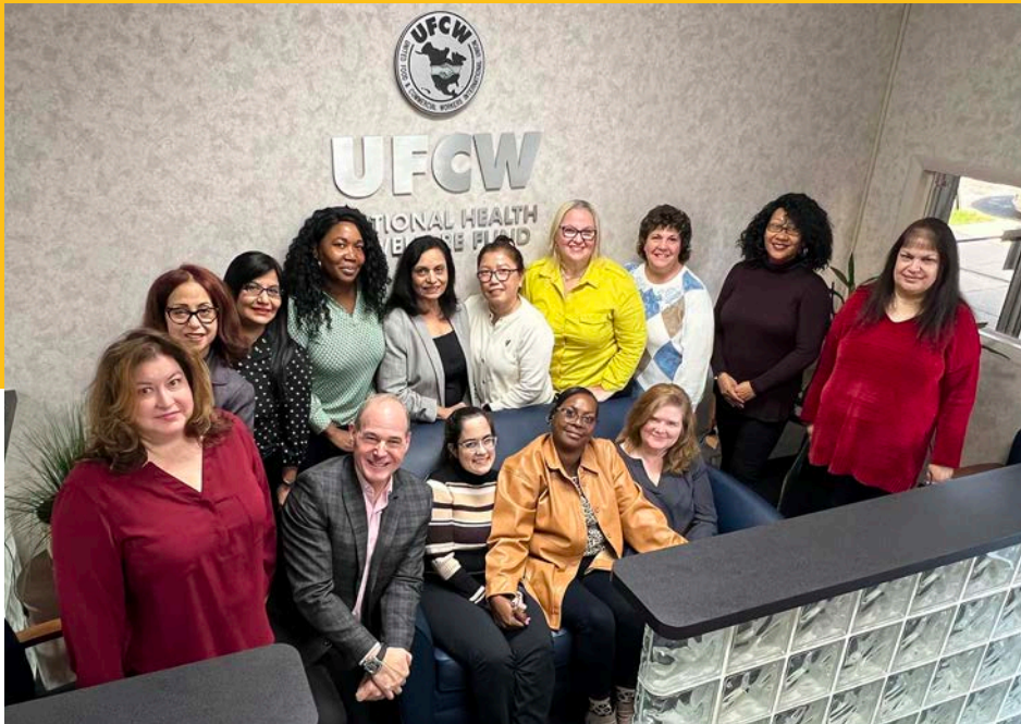
Englewood, NJ team