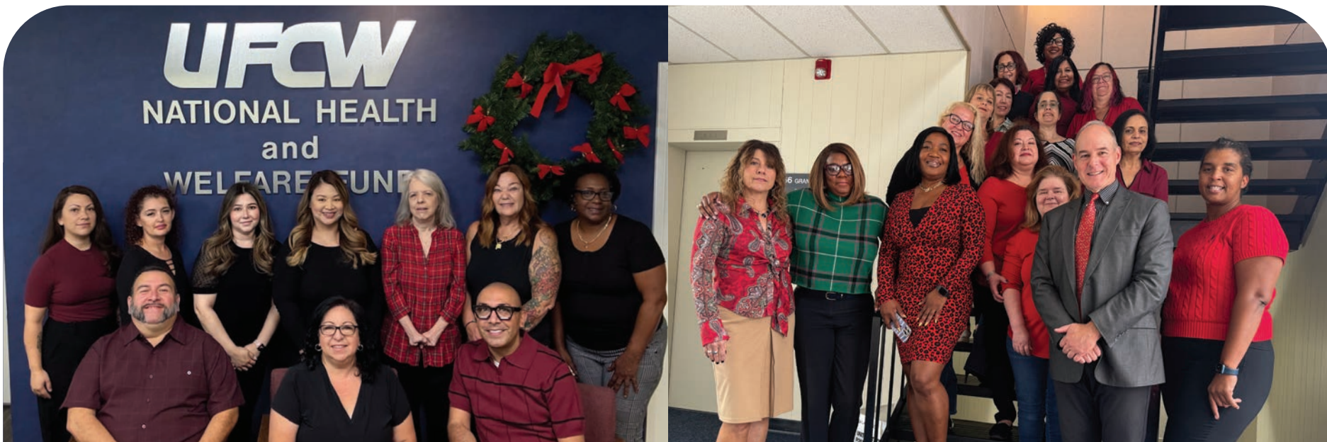
STOCKTON, CA TEAM